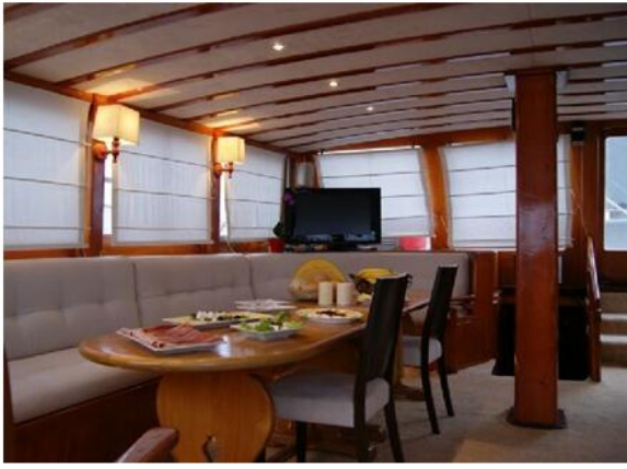
Gulet Eleganza - photos